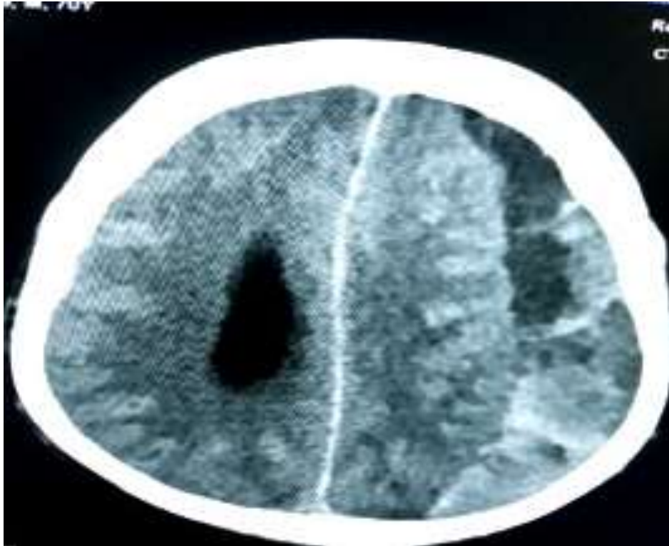
Fig 4: CT Scan of Brain: Left sided Large Acute Sub-Dural Hemorrhage (SDH).