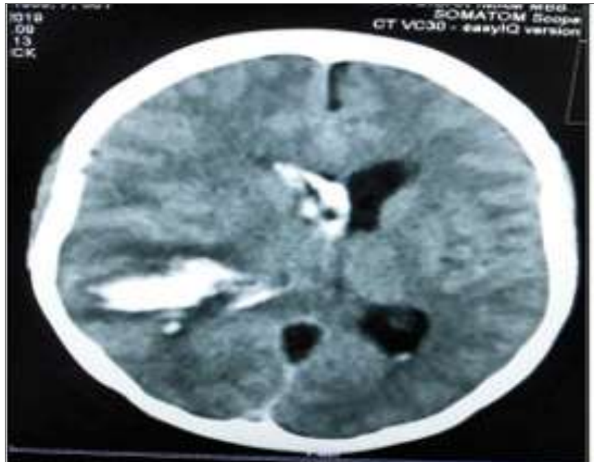
Fig 2: CT Scan of Brain: Right Parietal Acute Haemorrhage with Ventricular Extension (MCA).