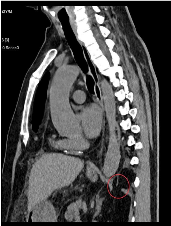
Fig 1: Sagittal section of computed tomography image of patient with Bochdalek hernia showing defect in the postero-lateral aspect of left hemidiaphragm through which retroperitoneal perinephric fat is seen herniating.

Initially other thoracic pathologies for instance, left middle lobe collapse, consolidation, pericardial fat pad, tension pneumothorax, lung sequestration, mediastinal lipoma, or anterior mediastinal mass were considered for differential diagnosis. They were ruled out by High Resolution CT thorax.