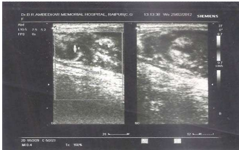
Fig 1: USG Image showing heterogenous area noted in epididymis and Testis;

frequency real time Gray scale ultrasonography and Doppler Aloka Prosound (M.No SSD-4000) –Siemens Sono line (M. No G-50).