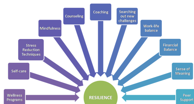
Fig 4: Diagram illustrates strategies that may help in building resilience against burnout [25].

A radiologist can lessen their own possibility of burnout by creating positive psychology within. Like all health problems, identifying issues of stress and burnout early and taking appropriate actions are key to resolving them. The methods like mindfulness meditation, music, aikido, yoga, running and spending time with friends and family, are effectiveness in reducing depression, anxiety, and stress; thereby improving quality of life, physical functioning and improved well-being among radiology professionals. Radiologist can create solid self-care propensities, getting much needed rest and working with others to make a positive group cultures that enables all wellbeing. One may need to stay flexible and be open-minded to try different things in order to find what works for each individual radiologist to achieve a healthier work environment and resilience as an end goal (Fig 4).