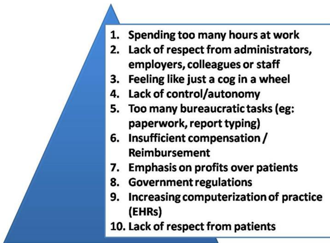
Fig 1: Factor Contributing Radiologist's Burnout (23)

Burnout can affect a radiologist's own psychological and physical wellbeing, which prompts a possible effect on the strength of the patient. At the point when somebody is encountering burnout, they may make more mistakes or not be as gainful as needed [17]. That prompts possible patient injury or misdiagnosis or cost factors for institution. On head of making blunders in persistent treatment, burnout can lead people to: Take part in amateurish conduct, Examine self-destruction or self-hurt, be missing from work more than typical or Resign early or change career [18]. In extreme cases its lead to suicidal tendencies. The Fig 1 and 2 demonstrates the important factors contributing radiologist's burnout and things they do to manage situation respectively.