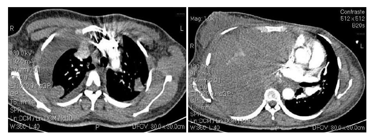
Fig 1: Mediastinal window CT scan: 40 year old patient, pleural fluid effusion (blue arrow), multiple bilateral subpleural nodules (red arrows) and right breast masses classified as T4 (blue arrowhead).

The authors have no conflict of interest to declare